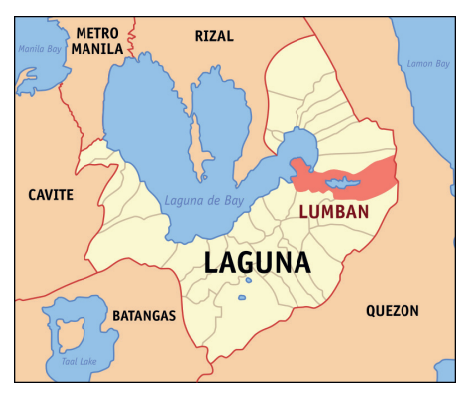
Figure 1. Location map of Lumban, Laguna

This case study was conducted in Concepcion, one of the sixteen barangays comprising the municipality of Lumban, Laguna. The barangay possesses certain geographical and socio-economic characteristics that make it a suitable research area. Firstly, despite being predominantly rural, where rice is the primary agricultural crop, it is also situated in a rapidly industrializing province. As a result, features of urbanization (i.e., commercialization and