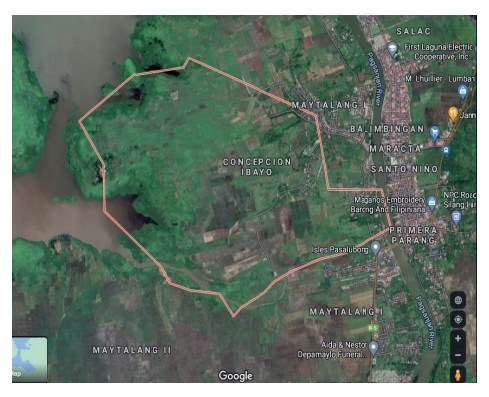
Figure 2. Research study area (Google, 2022)